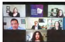
Professional Development Programs